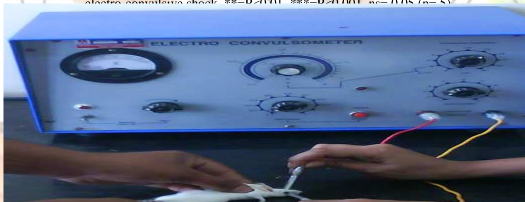
Fig. 1: Delivery of MES using electro convulsometer to mice with the help of corneal electrode

Values are mean ±SEM mice were pretreated with Vehicle and Mesua ferrea extracts oral 60 min. before the electro convulsive shock. **-P<0.01, ***-P<0.001, ns= 0.05 (n= 5)